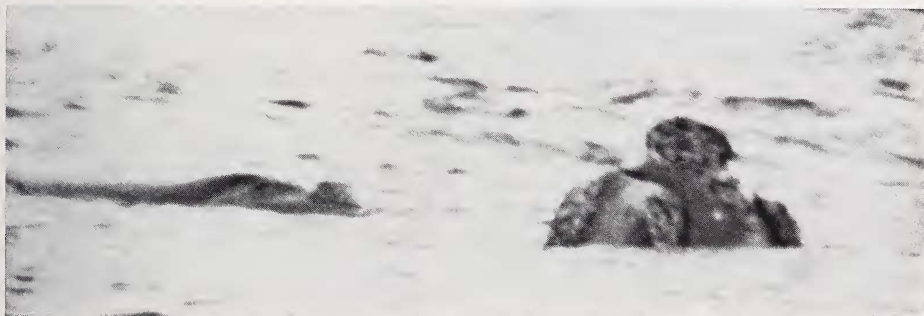
Fig. 9. A whale adopts a vertical posture and confronts an approaching individual. The partner of the vertical animal is behind it and submerged. The bonnet of the vertical animal is visible but the eyes of whales in this position were never seen above the surface. (Photo from ciné-sequence)

On November 6th 1971 one of pair of interacting whales in Plettenberg Bay twice lay inverted on the surface with flippers extended and penis erected for approximately two mins in each case following extensive bodily contact between the pair.